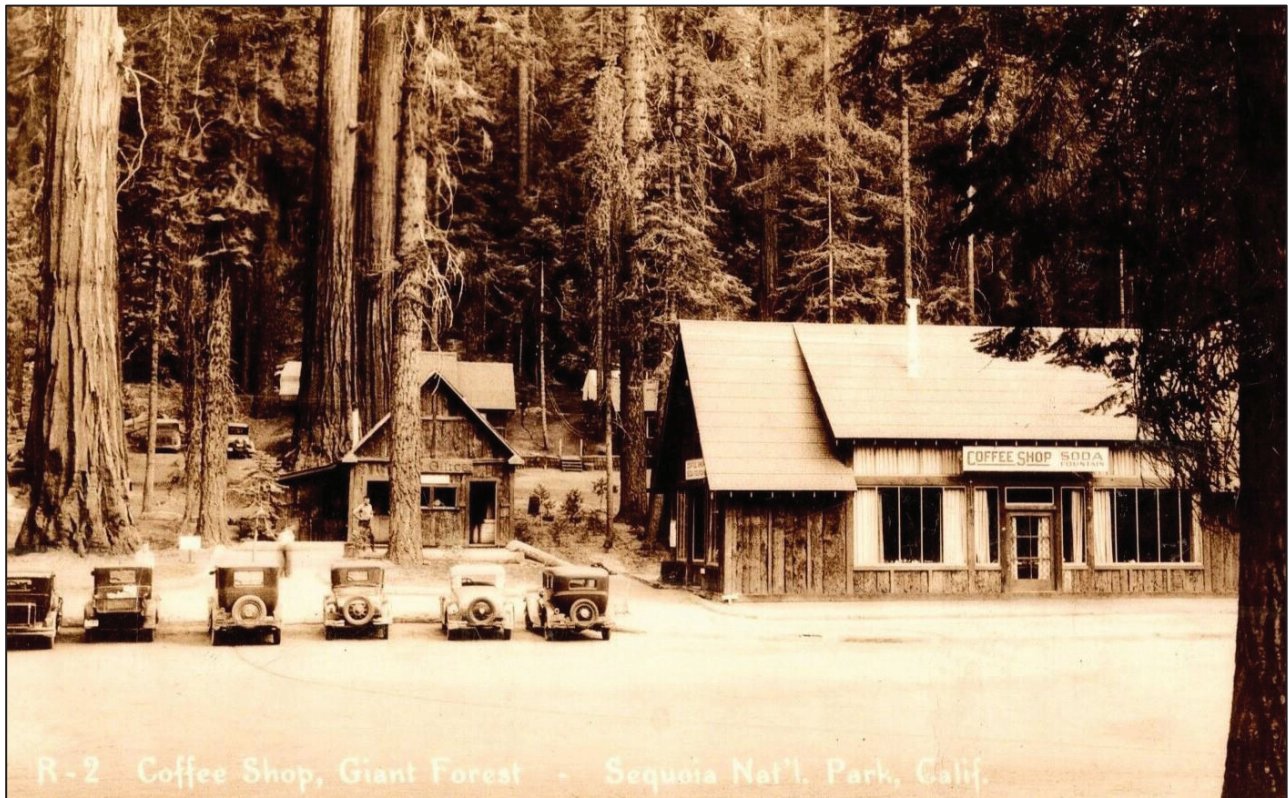
The Giant Forest coffee shop and post office. Also stores, a lodge and many cabins were once all together for the convenience of visitors.

Between the years 1995 and 2000 earlier buildings were demolished with accommodations and other commercial activity moving to Giant Forest Village Camp Kaweah Historic District just to the west, then the accommodations again to Wuksachi Village 7 miles north. The post office, still named Sequoia National Park, CA, moved to Lodgepole Village about 5 miles north.