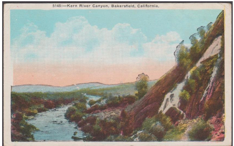
It seems the sender picked up this hand-colored card of the Kern River before driving up into the Sierras and Sequoia National Park.