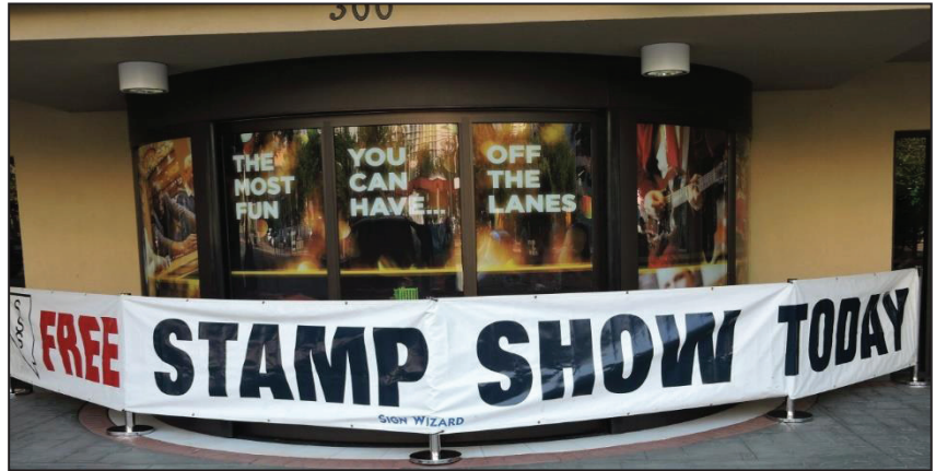
Entrance to the Bowling Stadium with our show banner.

A cachet cover with a special show cancellation for each day will be offered, along with hourly door prizes. The cachet and pictorial cancels will feature the USS Nevada “The ship that wouldn’t sink.”