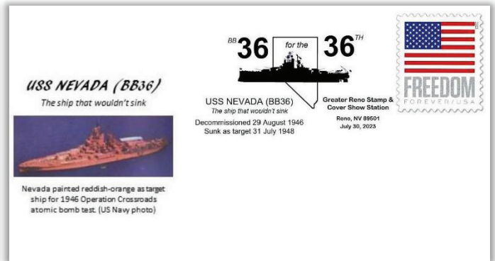
Mockup of July 30 Show Cover.

Before arriving at the show, consider some tips for a successful show visit: Create a want list. Pack a pair of tongs. Set your budget. Be prepared to convey to the dealer your collecting interests and standards, i.e., mint, NH, used, F-VF, VF, superb, graded, etc. If the dealer doesn't have it in stock, they may be able to watch for it and contact you if the item appears. Bring cash for most purchases, since not all dealers accept credit cards. Don't forget to wear your club name tag. The dealers do notice, and you can always ask for a discount as a club member. You also may consider contacting the dealer ahead of time to see if they can bring something specific. Many dealers have large inventories, and they cannot bring everything to the show. If you click on the show page at https://renostamp.org/show.html , you will find a diagram of the dealer table placements and a list of the dealers with emails.