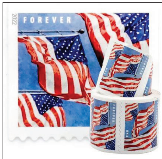
Flag coil roll of 100 - $29.99