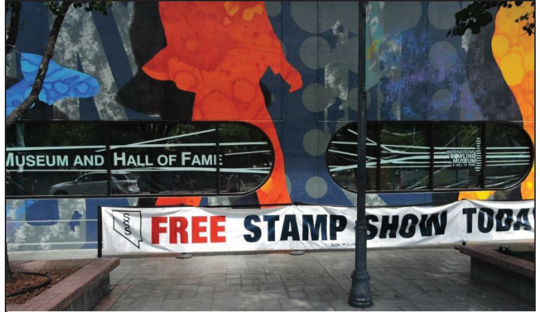
Street sign in front of the bowling stadium.