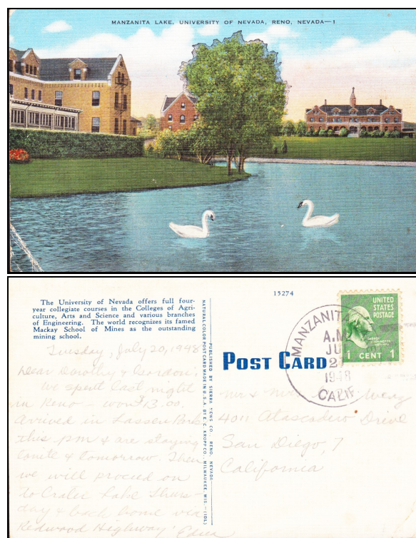
Figure 4: Manzanita Lake postcard.

After winning $13 at the Reno casinos [$170 in 2025] and buying this postcard, Edna travelled to Lassen Volcanic National Park. Although Lassen is a volcano and is known for its many geothermal features, there is also the lower elevation, beautiful Manzanita Lake section with camping, cabins and a store. From 1934 to 1967 there was also a post office and this is where the postcard's Manzanita Lake, Calif. 1948 postmark came from.